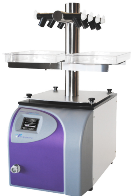
(BenchTop Pro 8L with optional tree-type manifold and condensate pan kit shown).