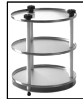
Bulk Shelf Rack